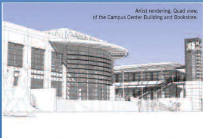
Artist rendering, Quad view, of the Campus Center Building and Bookstore.

PCC is committed to continuing to be a center of learning that serves students in their desire to learn. Through forward thinking, the college will meet or exceed the expectations of its internal and external constituencies for decades to come. In the process, the concepts approved by the voters will become a reality.