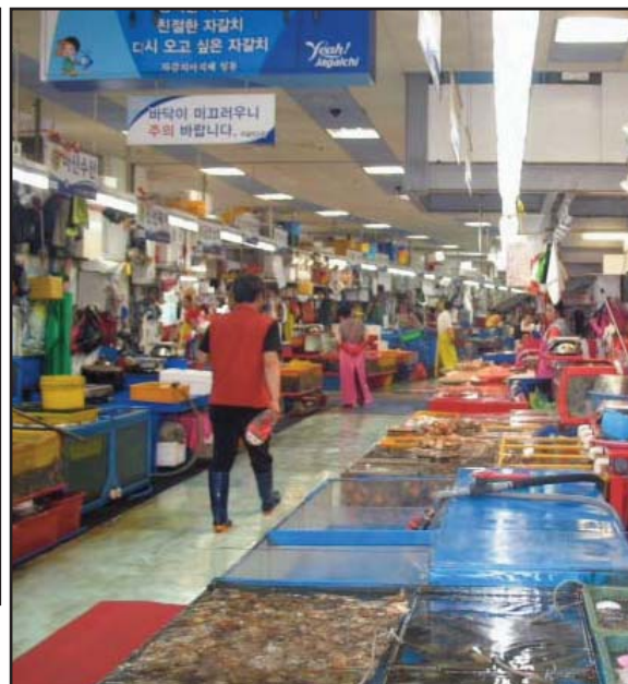
Above is the Beomeosa Temple complex in Busan. At left, customers in Busan can visit the Jagalchi Fish Market to get fresh seafood.

stayed in a lovely resort town on Bomun Lake, with a view across the lake from our hotel windows.