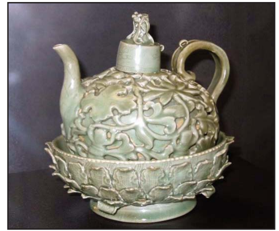
(Left) It is not an easy climb up the steps leading to the entrance to the Bulgusaka Temple. (Above) The beautifully decorated tea pot is an example of some of the fine ceramics created by Korean artisans.