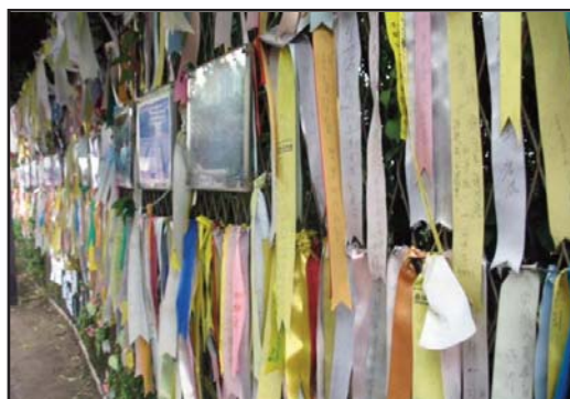
People in the south write messages to their relatives in the north and tack them to this wall.