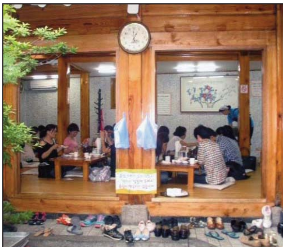
Tourists and locals enjoy a meal at the famous ginseng chicken soup restaurant.

Ever since friends heard about my preoccupation with Korea, I have received books, videos, and articles, such as three disks of "The Kimchee Chronicles." My obsession has been satisfied, at least somewhat. One of the things I would like to do on my next trip is a "temple stay." Is anybody interested in joining me?