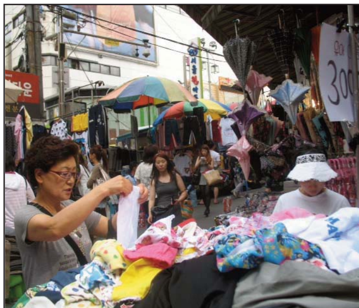
Korean women shop on a street in Seoul. Areas like this one are typical of so many streets in that city.