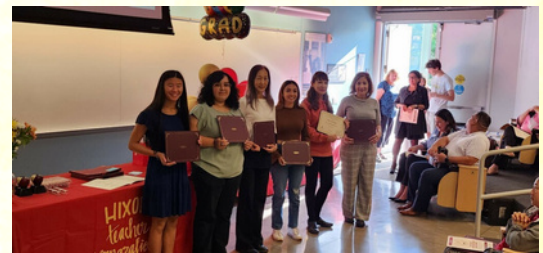
Future Teachers of Color (Cohort 3) being recognized at awards ceremony.