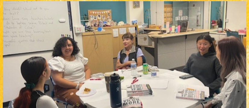
Some of the Future Teachers of Color (Cohort 3) during critical reading and dialogue sessions.