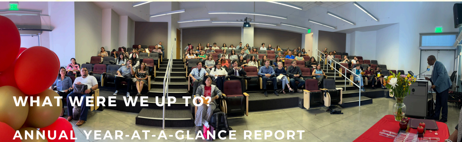
Students and family members at Spring 2024 Hixon Awards Ceremony