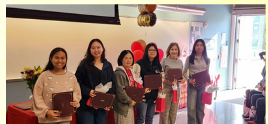
Some of the Reading Partners interns being recognized at awards ceremony