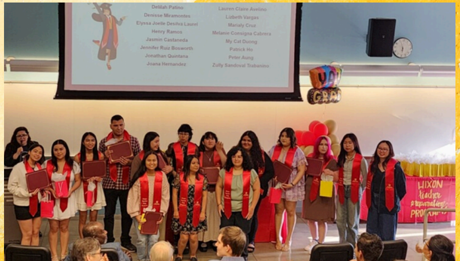
Some of Hixon 2024 graduates at annual Spring awards ceremony.

BUILDING COMMUNITY NETWORKS AND ADVOCACY