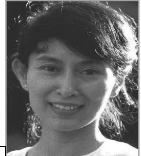
Aung San Suu Kyi

In 1990, the general election began. In addition, any party's member could contest. At that time, Suu Kyi was head of the National League for Democracy Party (NLD), and she won a landslide victory with 80 percent support of the country. However, the most powerful leader didn't want to grant the power, so they put all the elected pro-democracy leaders in their houses with guards watching out side. Suu Kyi was also placed under house arrest.