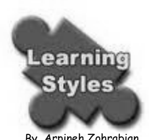
By Arpineh Zohrabian

Everyone has a unique way of studying. In general, learning styles are very helpful for students because they will help students to take advantage of the time that they spend while learning a