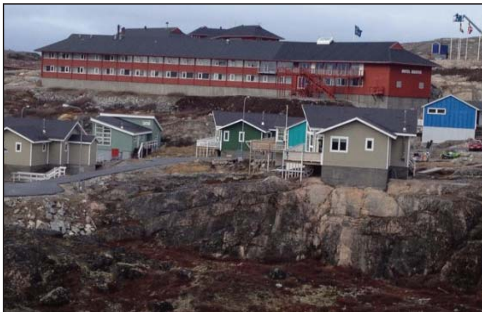
The Arctic Hotel in Ilulissat provided the accommodations for Kathy and Bruce and their fellow travelers. The ice cap and a glacier make up the frigid scenery.

involved standing still out in the freezing cold for hours. It was freezing and I didn't even have a heavy coat.