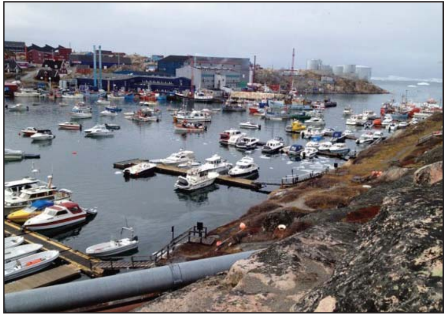
Kathy stands in front of a church in Ilulissat. Not everything is covered in ice. The photo shows an iceberg free Ilulissat harbor. Below, Bruce is examining a muskox pelt. The beauty of Greenland can be seen in photo of a sunset and icebergs.