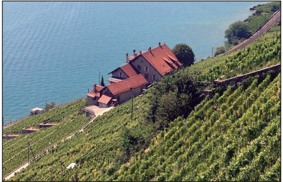
The photo (above) shows a view of a vineyard down from the house overlooking Lac Lemon. (Below left Pat takes a walk from New College heading for the Turf-Oxford. (Below right) The view of a church and garden was across the street from their house in Montielier.

The owners of the first house we stayed at picked us up at the airport in Paris and drove us to their home in Bazoches-du-Sur, a lovely little village near Versailles.