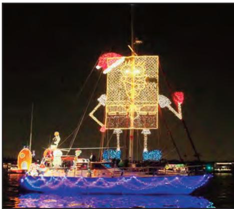
The retirees group joined the fun by being on a boat in the Newport Beach Annual Christmas Boat Parade. Even though it was cold and wet, it was a great trip.