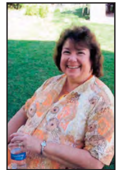
Photos from the mixer are poor quality because the camera malfunctioned and kept slipping into video mode. The shots that came out had to be converted from the video.